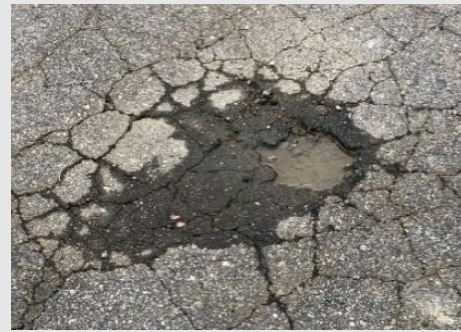
Pothole located on Thornwood Court

The roads in Hadley Park were originally paved early in 2005 prior to construction of the houses. They have held up very well over the past 17 years but we are noticing more and more cracks in the pavement and several developing potholes (i.e., a pothole on Briar Creek measuring 12" x 18"). Potholes are created by rain freezing and thawing, a familiar weather activity. As we all know, hitting a pothole can do some serious damage to tires and your vehicle.